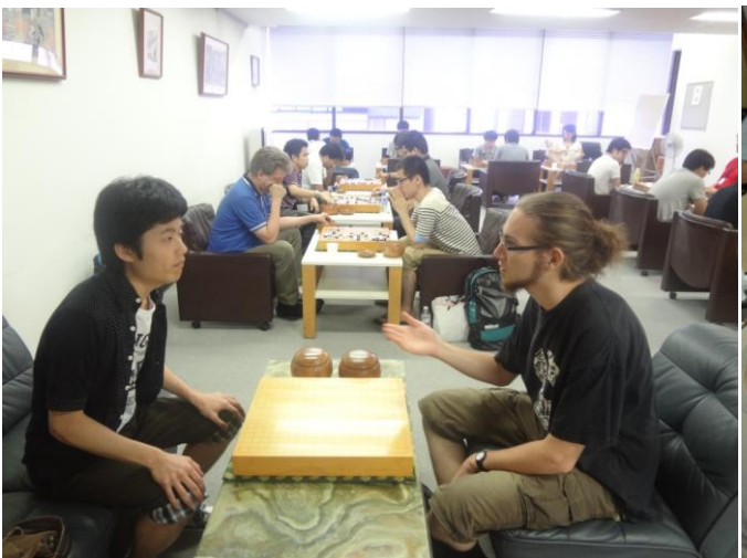
A goodwill match against the university students